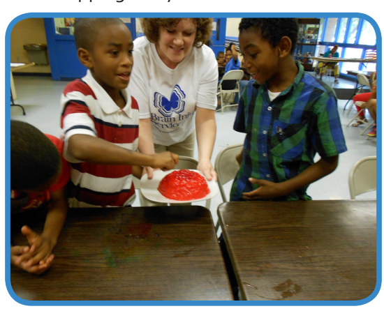
A brain mold helps teach students about the importance of wearing a helmet.

What advice do you have for a school or community group that may be interested in working with your organization or hosting their own helmet and bicycle safety event? I'd recommend getting all of your collaborators involved as soon as possible in the planning process and to help promote the event. For example, the recreation center was very helpful in promoting our event to the participating students and their parents through flyers sent home with the students. I'd plan a month or two ahead of time, avoiding school holidays and being flexible for weather cancellations. Also, allow yourself enough time for your product orders just in case you need to exchange or return any of your order or if there are unexpected shipping delays.