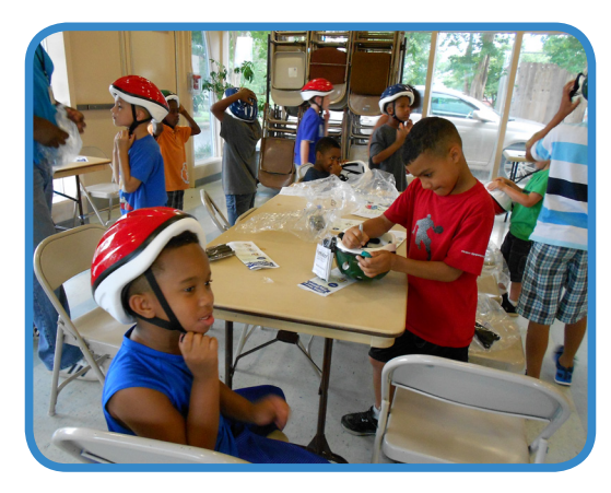
Students at Preston Park Elementary in Roanoke decorate helmets provided by BISSWVA.

What does Brain Injury Services of Southwest Virginia (BISSWVA) do? BISSWVA's mission is to make a positive, measurable difference in brain injury survivors' abilities to fulfill their service potential and optimize their reintegration into their families and communities. We also promote brain injury awareness all year long, but especially in March, which is Brain Injury Awareness Month.