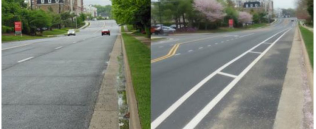
Example Road Diet | VTRC

VDOT works hard to provide a roadway network that operates safely, efficiently, and effectively. In 2019, the Commonwealth Transportation Board approved the deployment of highly effective, low-cost safety improvements to help reduce serious injury and fatal crashes across the Commonwealth. This data-driven strategy focuses on proactively targeting locations with higher crash risk. The goal is not to wait for crashes to occur before we proactively treat high-risk locations on the roadway network!