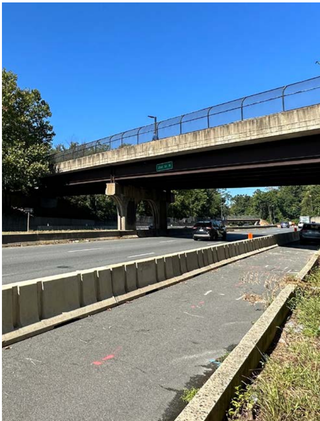
Above: Under Construction — 21st Street North over I-66 Bridge Rehabilitation