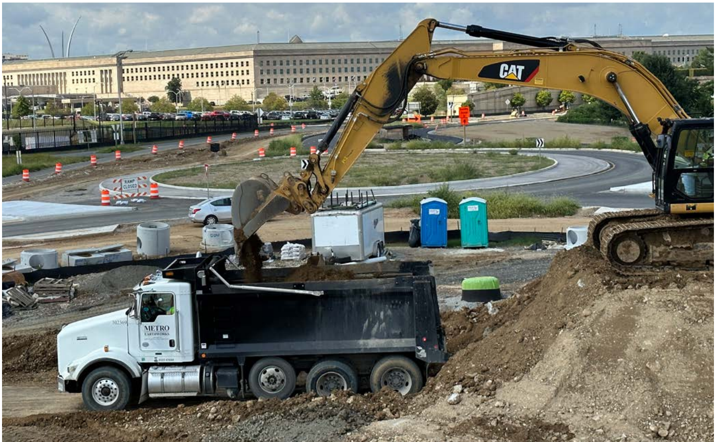
Above: Under Construction — Boundary Channel Drive at I-395 Interchange Improvements