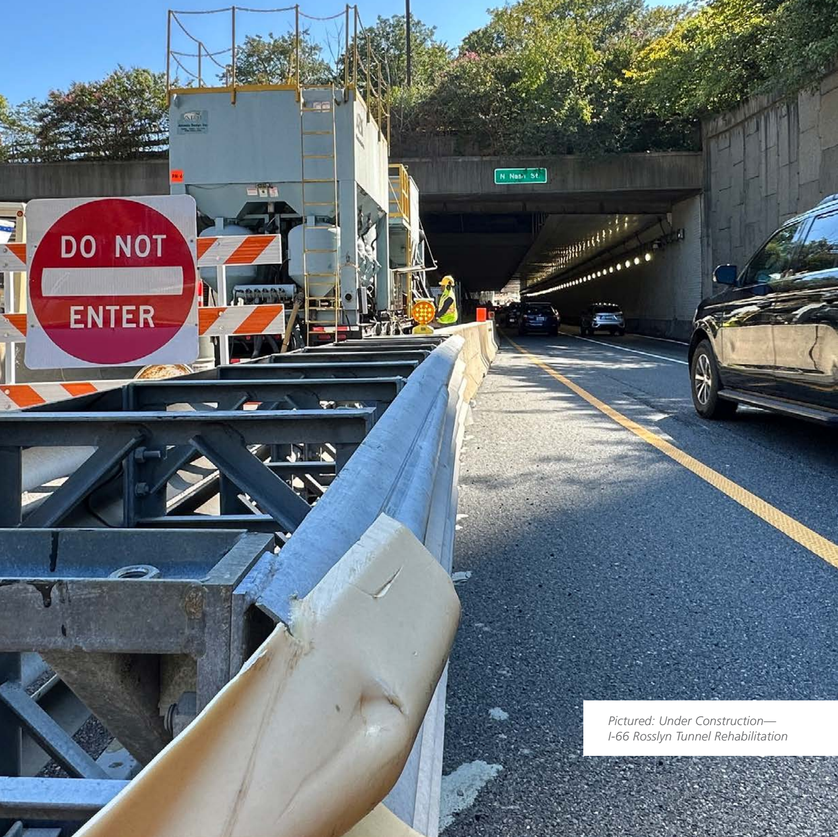
Pictured: Under Construction— I-66 Rosslyn Tunnel Rehabilitation