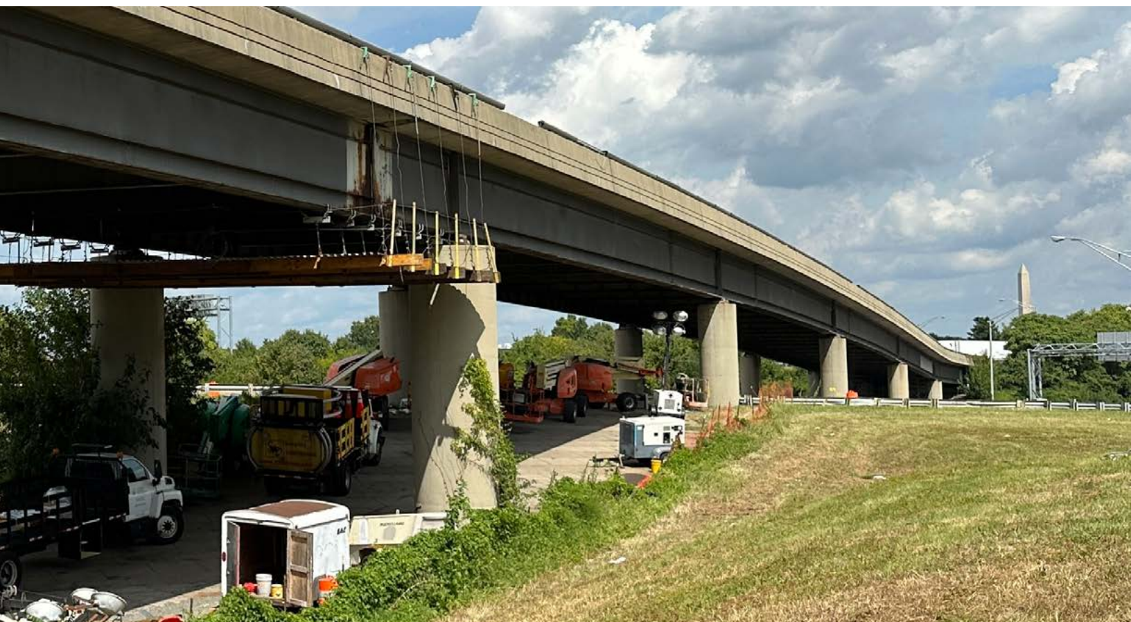
Below: Under Construction — I-395/Route 1 Southbound Exit 8C Bridge Repairs